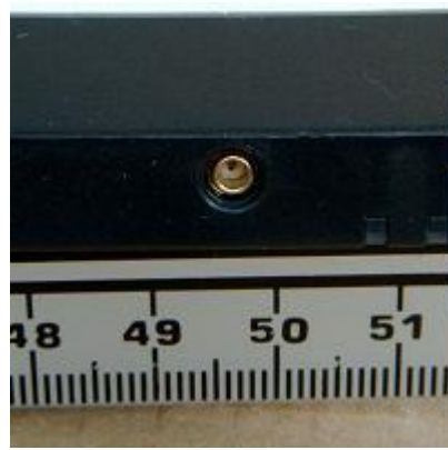
Female MC (Lucent) Connector