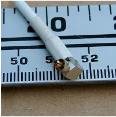
Male MC (Lucent) Connector